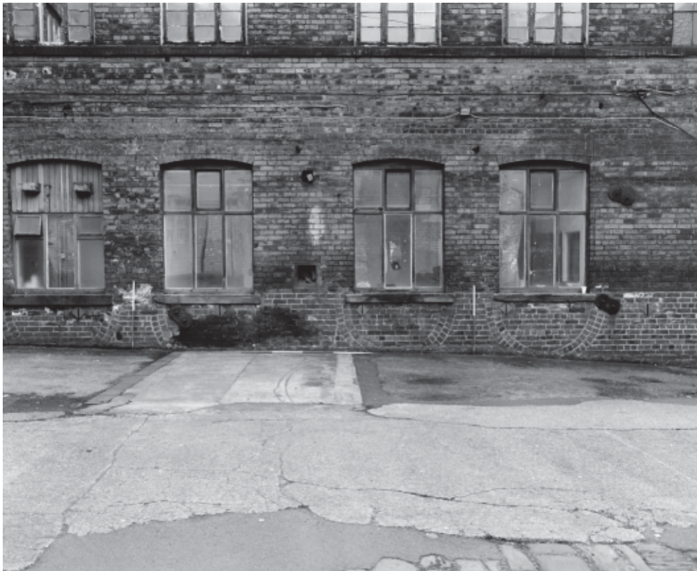
Plate 18: Courtyard elevation of Arundel Street range, note inverted arches © University of Sheffield. Reproduced by permission