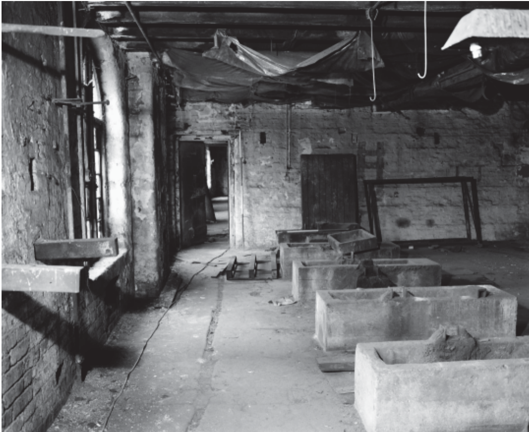
Plate 24: North grinding workshop with concrete troughs on second floor