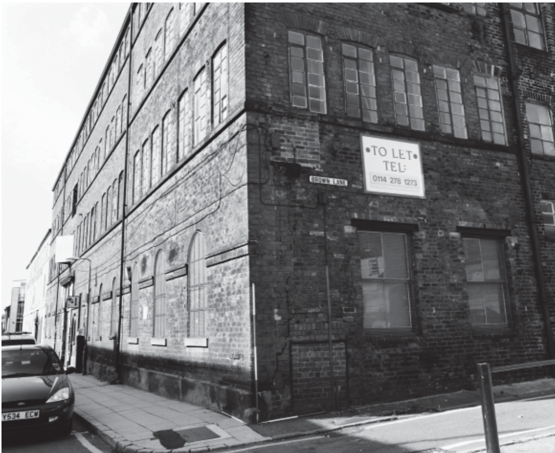
Plate 16: View of Arundel Street range from corner of Brown Lane