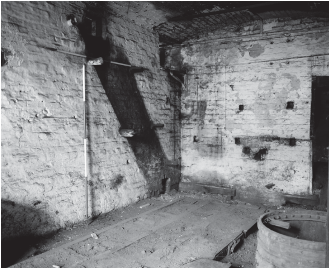
Plate 31: Wall scar of diagonal belt drive leading to high level wall box