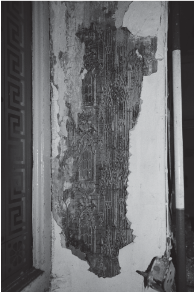
Plate 5: Architectural wallpaper in Director's office overlooking Brown Lane