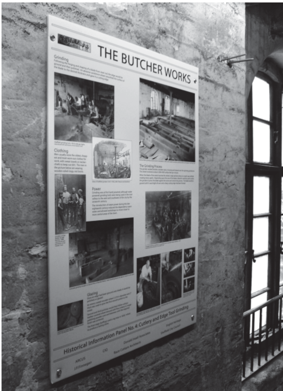
Plate 33: Interpretative display boards in second floor grinding workshop