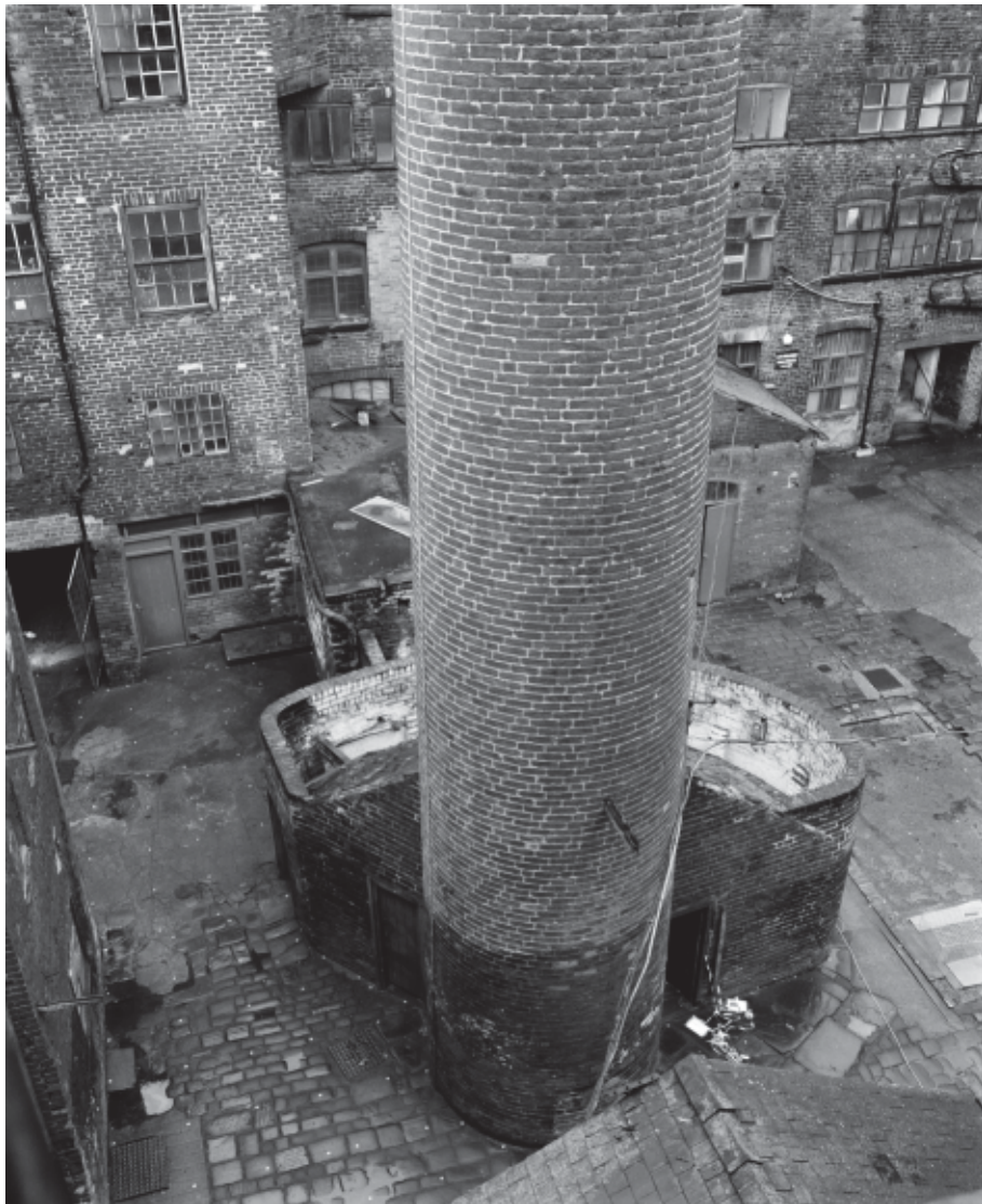
Plate 26: Central courtyard chimney with curved suite of toilets