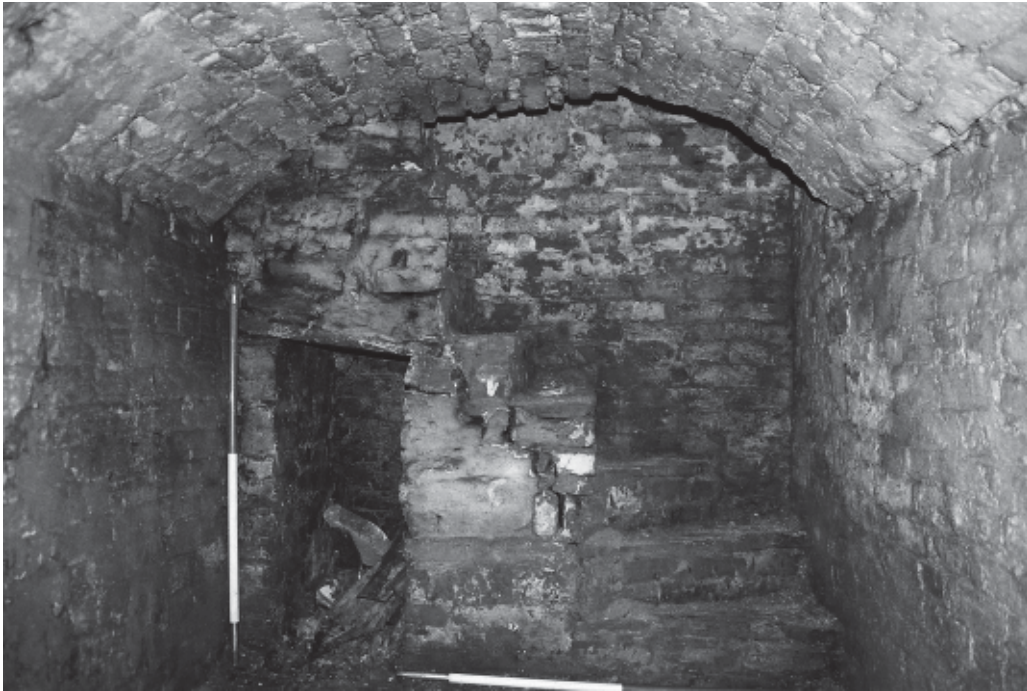
Plate 3: View of cellars below houses on corner of Eyre Lane and Brown Lane