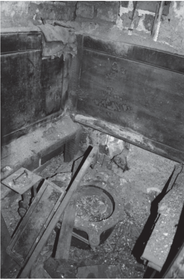
Plate 12: Detail of hand operated pan closet with panelled sides