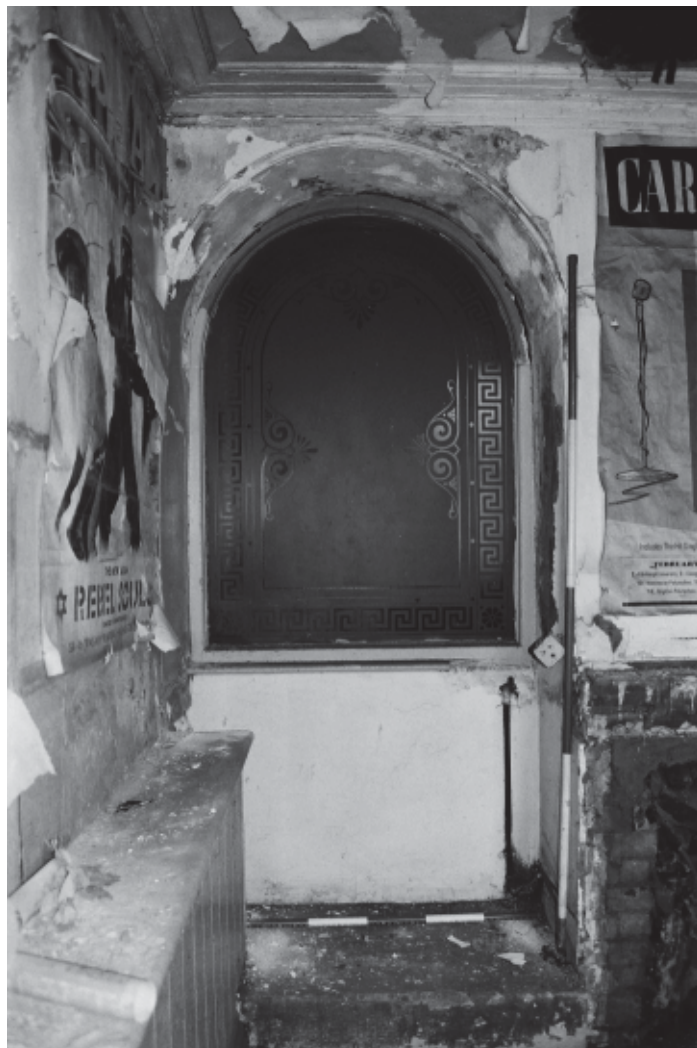
Plate 4: Frosted glass panel in Director's office overlooking Brown Lane