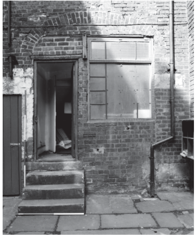
Plate 8: Blocked cart passage following conversion to Caretaker's House