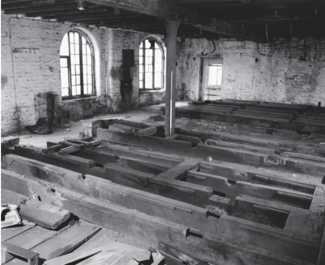
Plate 23: South grinding workshop with wooden framed troughs on second floor