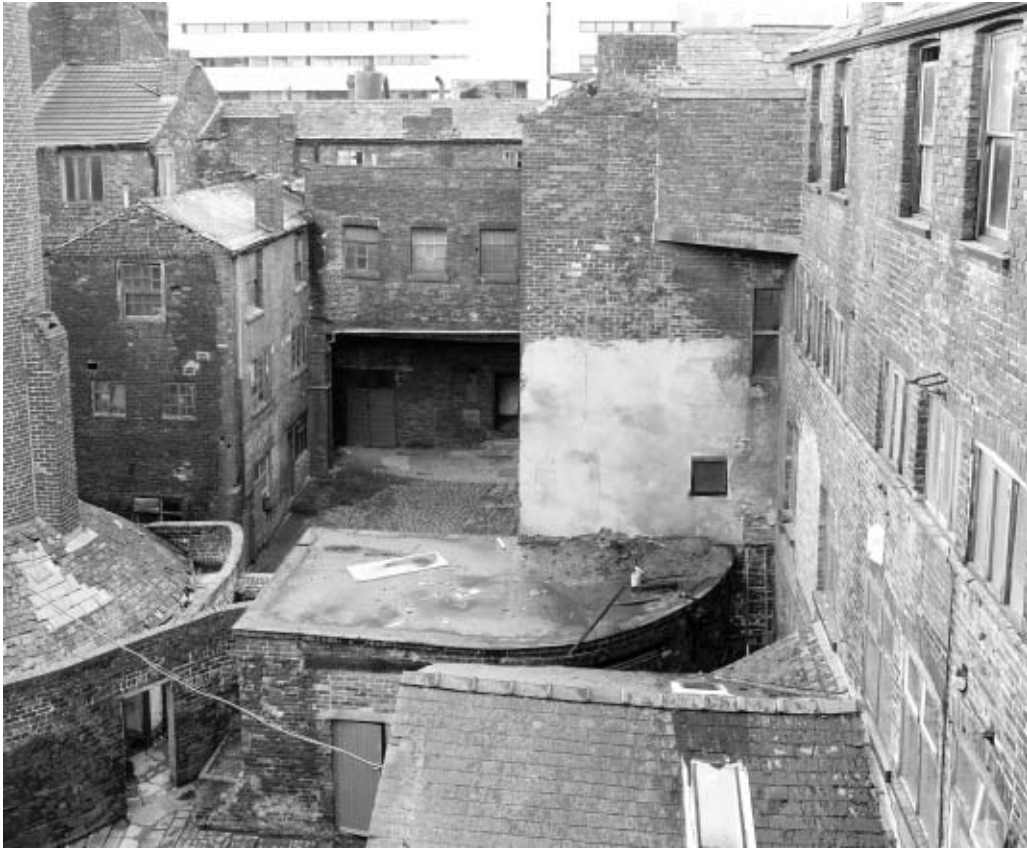
Plate 10: View looking north across courtyard to Eyre Lane buildings