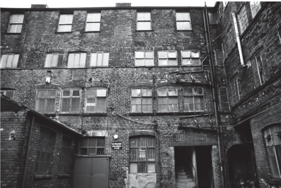
Plate 14: Courtyard elevation of Brown Lane range, note raised upper levels