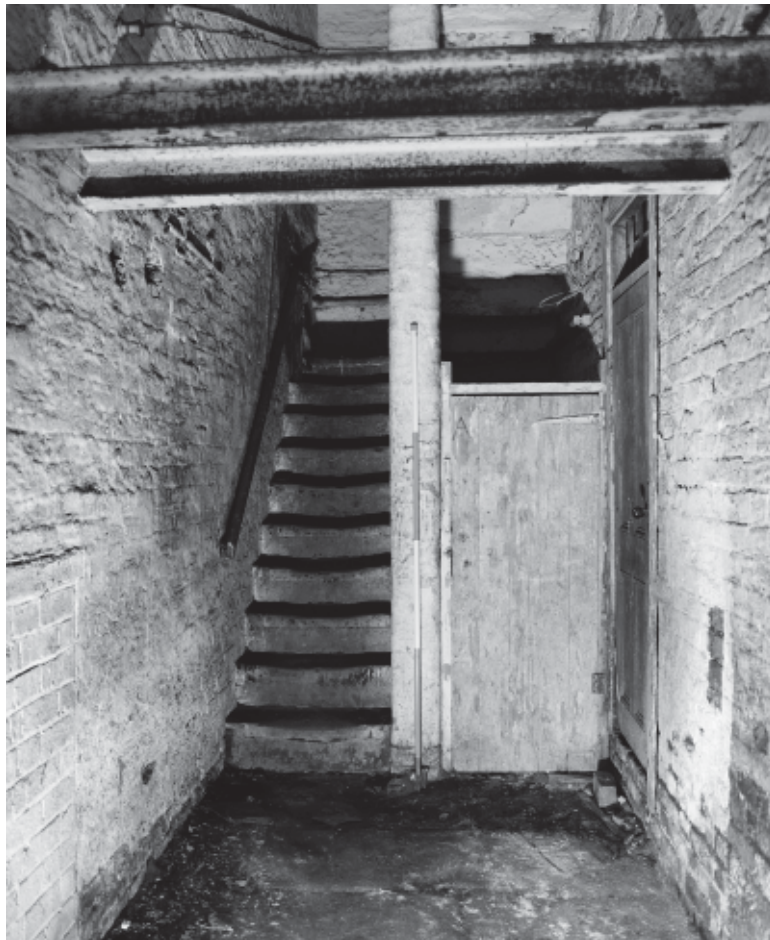
Plate 22: Central fireproof stairwell in West range