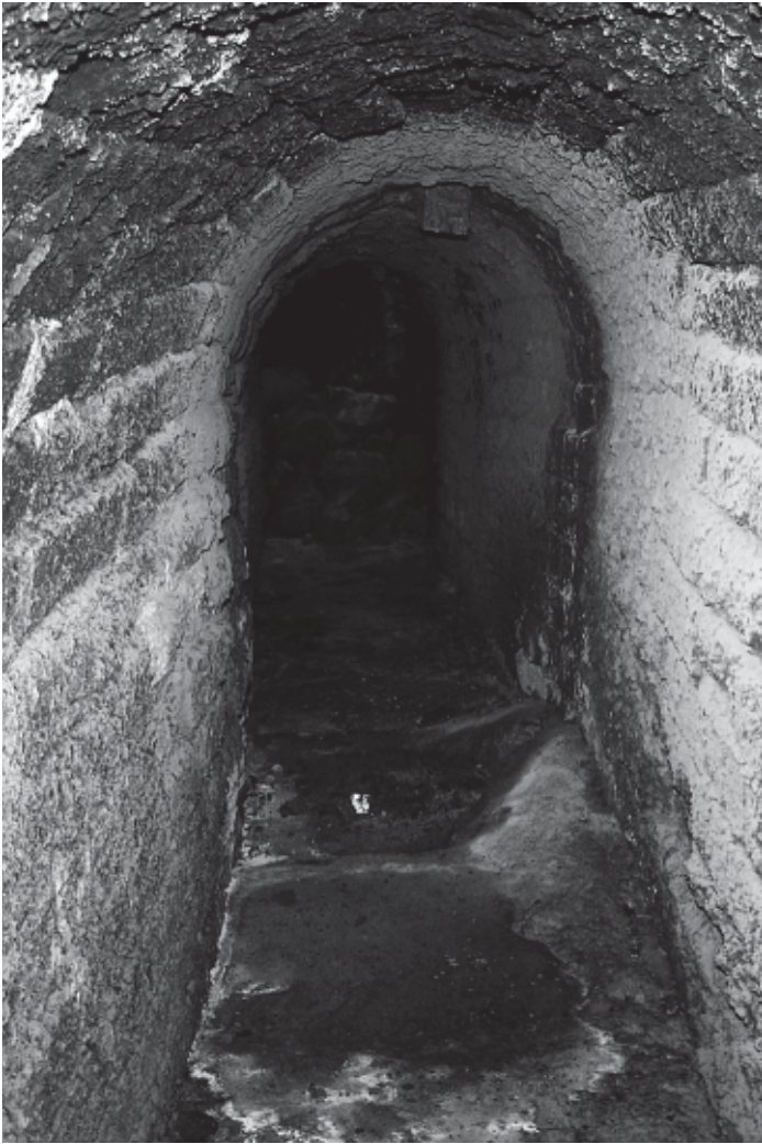
Plate 27: Chimney flue connecting chimney with former courtyard boilers