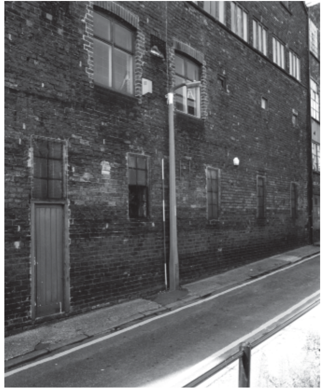
Plate 13: View looking north along Brown Lane, note first floor ventilation grills