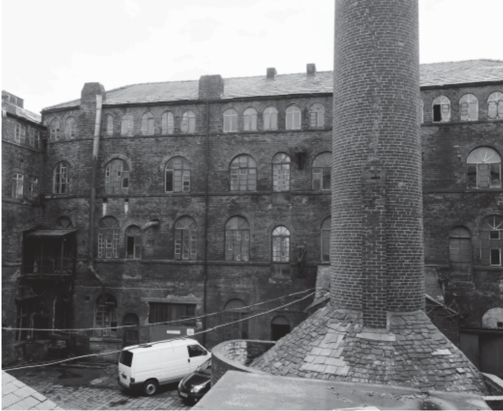
Plate 21: Courtyard elevation of West range