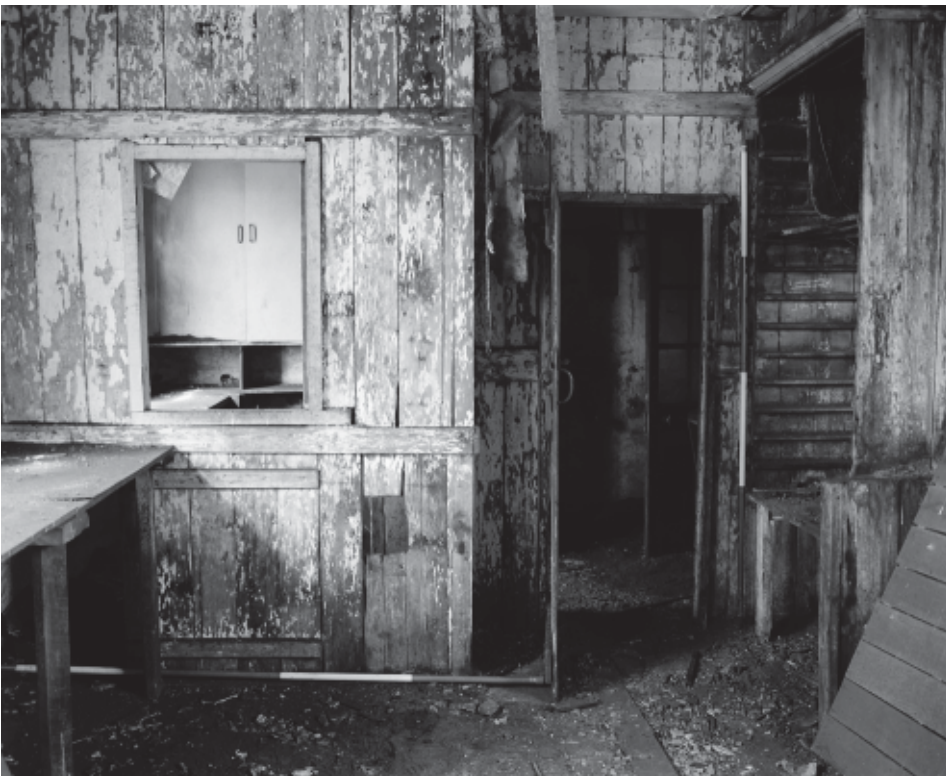
Plate 9: View of partitioned workshops on third floor overlooking Eyre Lane