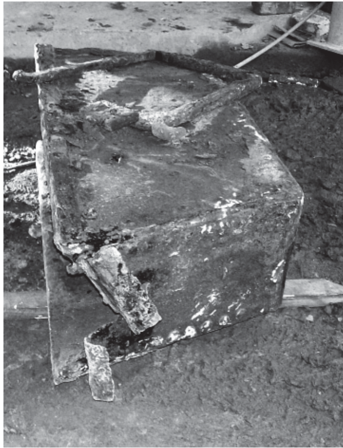
Plate 30: Riveted metal grinding trough found beneath concrete floor of former Arundel Forge facing Brown Lane