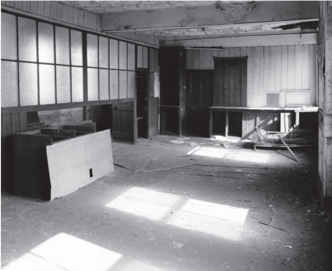
Plate 15: View of second floor packing rooms overlooking Brown Lane