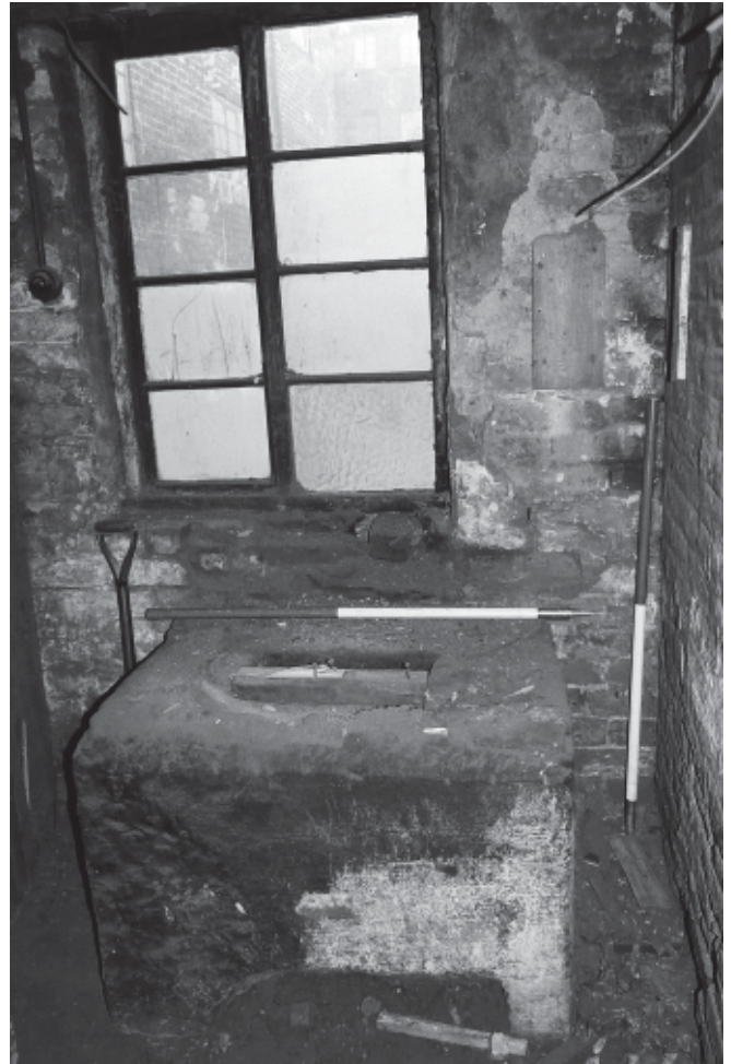
Plate 6: Detail of anvil block in hand forge