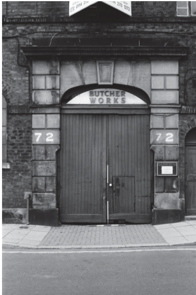
Plate 17: Exterior detailing of cart-passage fronting Arundel Street