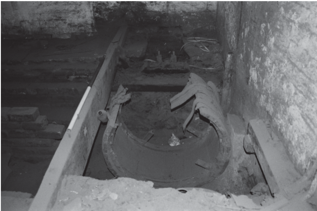
Plate 29: Second floor drive channel with wooden drum still in situ, West range