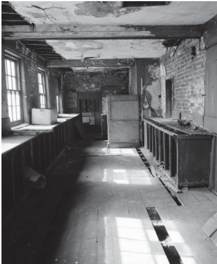
Plate 11: Cupboards in packing room overlooking courtyard, building D