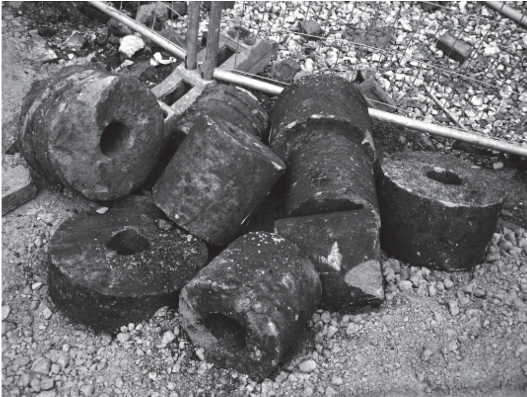
Plate 1: Selection of grinding stones recovered from the Butcher Works