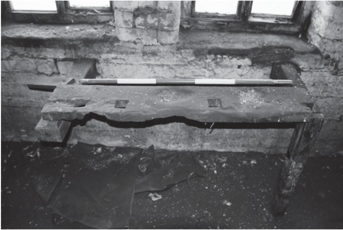
Plate 25: Surviving cutlers bench on third floor of West range