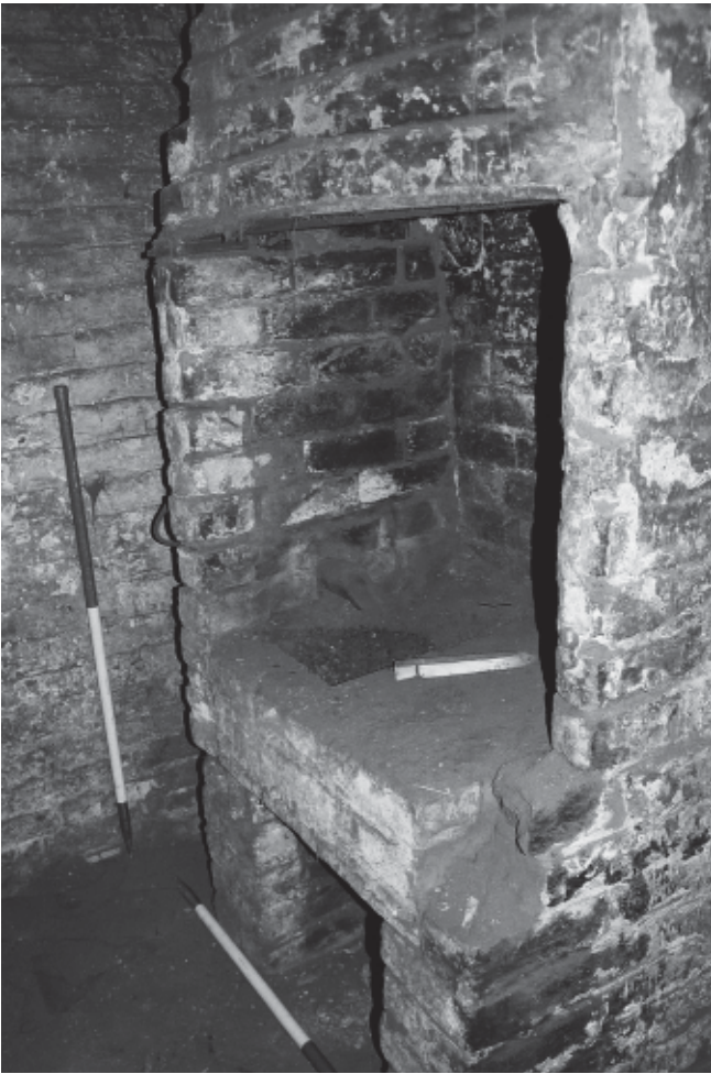
Plate 7: Detail of hearth and bellow in hand forge