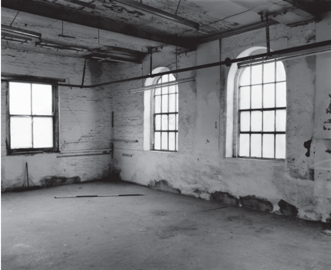
Plate 19: General view of interior of former engine room in Arundel Street range