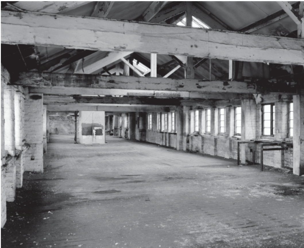
Plate 20: Large open plan workroom on top floor overlooking Arundel Street