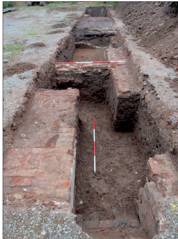
Plate 1: General view of Trench 1 from south