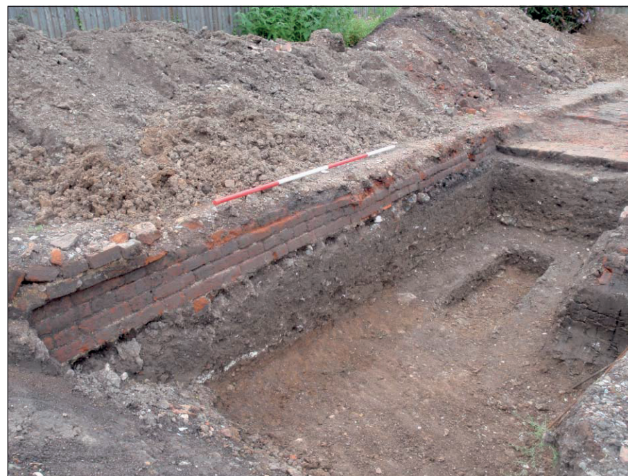
Plate 4: Wall 119, view from north-west