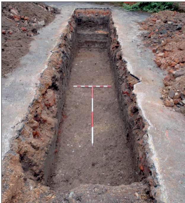
Plate 8: General view of Trench 2 from north-west