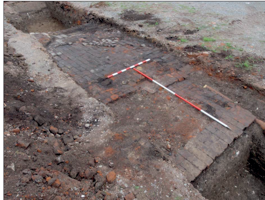
Plate 7: Yard surface 102, view from north-east