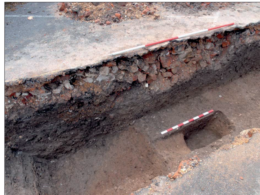
Plate 9: North-east facing section of pit 207