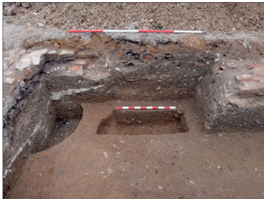
Plate 3: Pits 107 (left) and 136 (right) viewed from the west