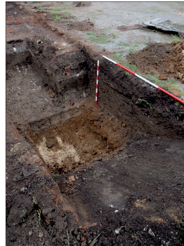
Plate 2: East facing section of sondage at northern end of Trench 1 showing overburden and natural geology, view from north-east