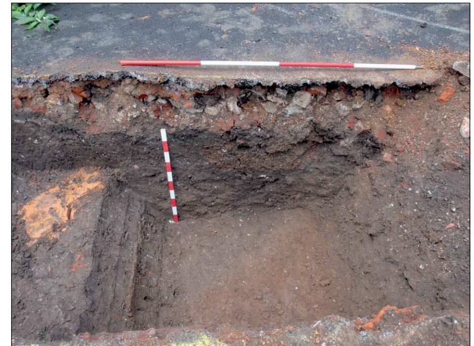
Plate 10: North-east facing section of maching-dug sondage in Trench 2 showing pit 213