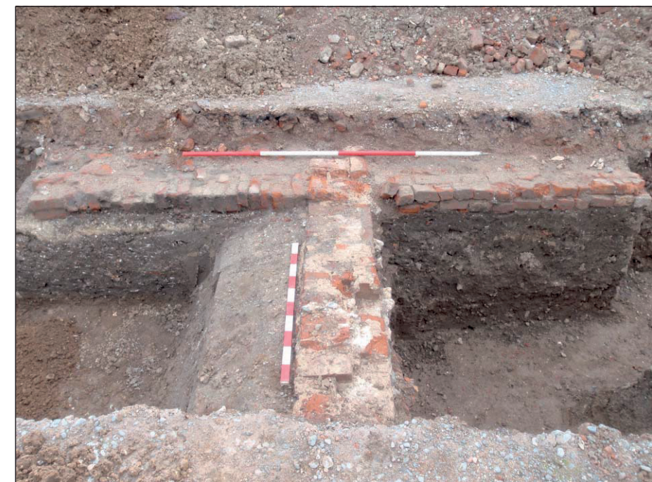
Plate 5: Walls 125, 126 and 127 of Building 1, view from west