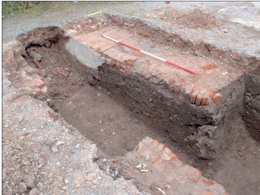
Plate 6: Cellar of Building 1 comprising walls 129, 130 and 133, view from north-east